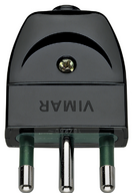
00202 - 2P+E 16A S17 axial plug black