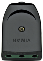
00222 - 2P+E 16A P17 axial outlet black