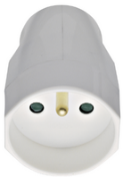
00251.B - 2P+E 16A French axial outlet white