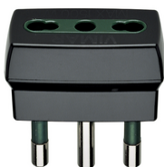
00300 - S17 adaptor +P17/11 outlet black