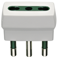
00300.B - S17 adaptor +P17/11 outlet white