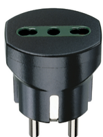
00301 - German/French adaptor +P17/11 out. black