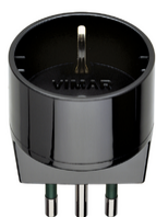
00302 - S11 adaptor +P30 outlet black