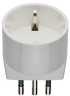
00302.B - S11 adaptor +P30 outlet white