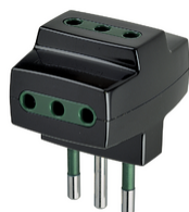
00320 - S11 multi-adaptor +3P11 outlets black