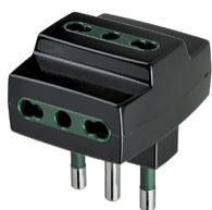
00321 - S17 multi-adaptor +3P17/11 outlets black