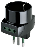
00322 - S11 multi- adaptor+2P11+P30 outlets black