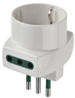
00322.B - S11 multi-adaptor+2P11+P30 outlets white