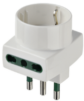
00323.B - S17 multi-adaptor+2P17/11+P30 out. white