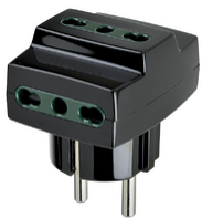
00324 - S31 multi-adaptor +3P17/11 outlet black