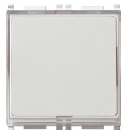
14050 - 1P NO 10A 250V name-plate button white