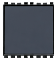
20050 - 1P NO 10A name- plate push button grey