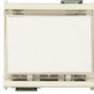
08420 - 1P NO 10A 12- 24V name-plate push button