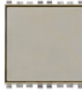
20050.N - 1P NO 10A name-plate push button Next