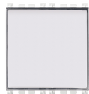
19050.B - 1P NO 10A name- plate push button white