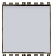
19050.M - 1P NO 10A name- plate push button Metal