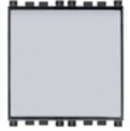
19050 - 1P NO 10A name- plate push button grey