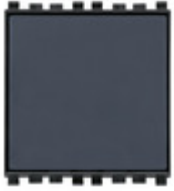
20050 - 1P NO 10A name- plate push button grey