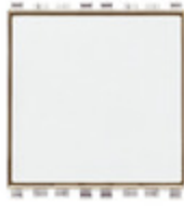
20050.B - 1P NO 10A name-plate push button white