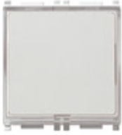
14050 - 1P NO 10A 250V name-plate button white