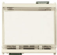
08420 - 1P NO 10A 12-24V name-plate push button