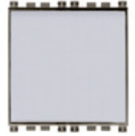
19050.M - 1P NO 10A name-plate push button Metal