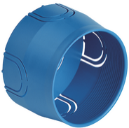
V71001 - Flush mounting box ø 60mm light blue