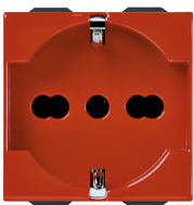
09210.R - 2P+E 16A universal outlet red