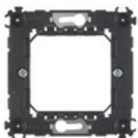
09602.1 - Frame 2M +claws 71mm