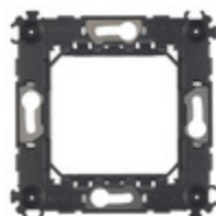
09603.1 - Frame 2M without screws 71mm