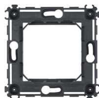
09603.1 - Frame 2M without screws 71mm