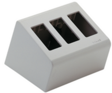
Table mounting box with backplate, 60 mm depth, for 3 8000 standard modules, cable entry with cord-grip, ivory. Not suitable for 08064..., 08065..., 08081..., 08341, 08342