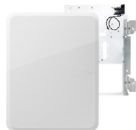
03816 - By-alarm Plus 24M switch box adaptor