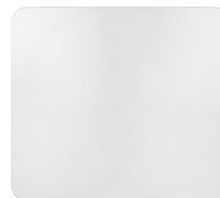
03814 - By-alarm Plus techno box 25-65