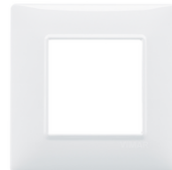
14642.01 - Plate 2M techn. white