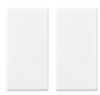
14506 - Button 1M for RF switch white - 2pieces