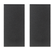
19506 - Button 1M for RF switch grey - 2pieces