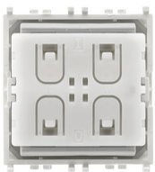
03906 - Zigbee Friends of Hue RF switch