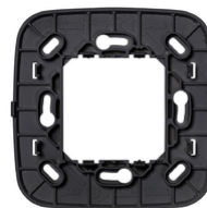
19507.RN - Frame RF device Round plate grey