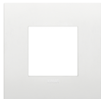
19642.74 - Classic plate 2M technopolymer white