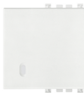
19022.B - Button 2M white