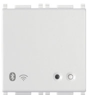
14597 - IoT connected gateway 2M white