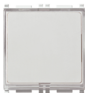
14050 - 1P NO 10A 250V name-plate button white