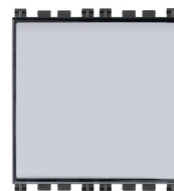
19050 - 1P NO 10A name- plate push button grey