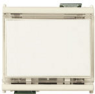
08420 - 1P NO 10A 12-24V name-plate push button