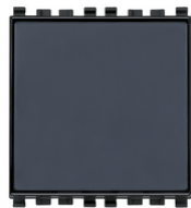
20050 - 1P NO 10A name- plate push button grey