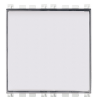
19050.B - 1P NO 10A name- plate push button white