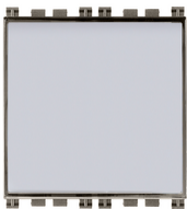
19050.M - 1P NO 10A name- plate push button Metal