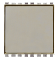
20050.N - 1P NO 10A name- plate push button Next