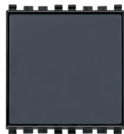
20050 - 1P NO 10A name- plate push button grey