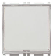
14050 - 1P NO 10A 250V name-plate button white