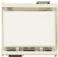
08420 - 1P NO 10A 12-24V name-plate push button