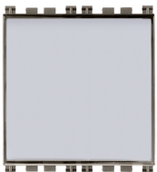
19050.M - 1P NO 10A name- plate push button Metal