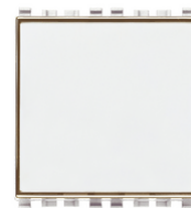
20050.B - 1P NO 10A name- plate push button white