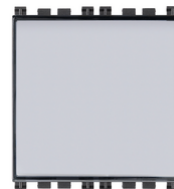
19050 - 1P NO 10A name- plate push button grey