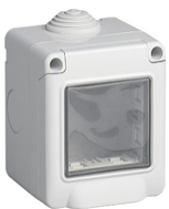
14902 - IP55 enclosure 2M