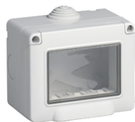
14903 - IP55 enclosure 3M