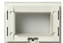
16813.Q.B - IP55 frame 3M white