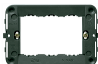
16713 - Frame 3M +screws