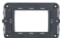
16723 - Frame 3M Arké idea+screws grey