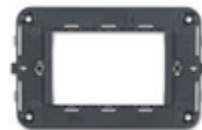
16723 - Frame 3M Arké idea+screws grey