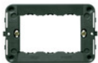
16713 - Frame 3M +screws