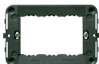
16713 - Frame 3M +screws