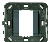
17086 - Frame 1M smooth no/screws ø60/56x56mm g