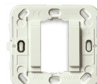
17086.B - Frame 1M smooth no/screws ø60/56x56mm w