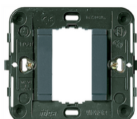
17080 - Frame 1M smooth front+claws grey