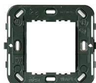
17087 - Frame 2red.M no/screws ø60/56x56mm