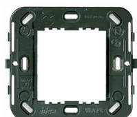
17087 - Frame 2red.M no/screws ø60/56x56mm