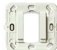
17086.B - Frame 1M smooth no/screws ø60/56x56mm w