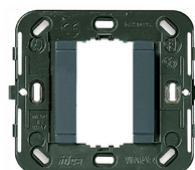
17086 - Frame 1M smooth no/screws ø60/56x56mm g