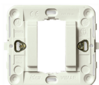
17080.B - Frame 1M smooth front+claws white