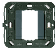
17086 - Frame 1M smooth no/screws ø60/56x56mm g