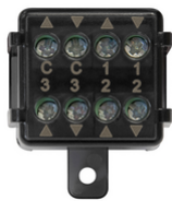
03997 - Quid rolling shutters module