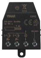
03992 - Quid - Step relay module 10A+reset