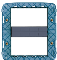
19618 - Frame 8M with screws