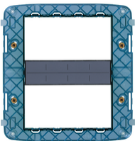
19618 - Frame 8M with screws