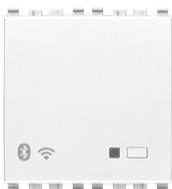
20597.B - IoT connected gateway 2M white