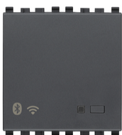
20597 - IoT connected gateway 2M grey