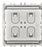
03925 - Bluetooth Low Energy RF device