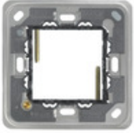
20607 - Frame 2M BS