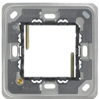
20607 - Frame 2M BS