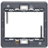
20608 - Frame 3M BS