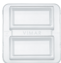
21618.C - Cover 8M Eikon/Arké/Plana mount- frame