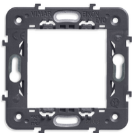
21603 - Frame 2M without screws 71mm