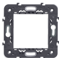
21603 - Frame 2M without screws 71mm