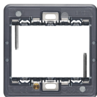
20608 - Frame 3M BS