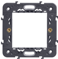
21602 - Frame 2M +claws 71mm