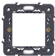
21602 - Frame 2M +claws 71mm